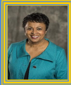
Honorable Carla Hayden Librarian of Congress Humanitarian Award