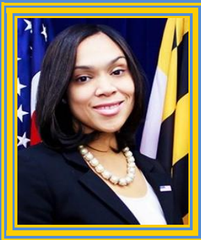
Honorable Marilyn Mosby Baltimore City State's Attorney KM Excellence in Advocacy Award